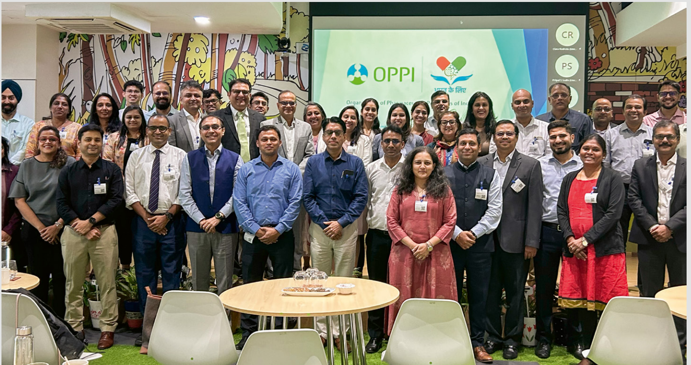
UCPMP Workshop, Mumbai Office

OPPI along with EY as a Knowledge partner hosted an in-person Workshop on Implementation and Readiness of UCPMP 2024 on March 18, 2025, in Pfizer Mumbai and Delhi offices. The session covered potential areas wherein members were seeking clarification on the implementation and the data collation, among other topics. It was quite insightful, engaging session and had a good participation from OPPI member companies, especially colleagues from Ethics and Finance teams.