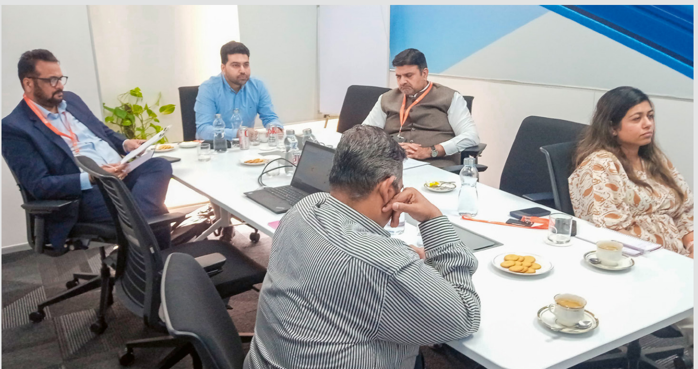
UCPMP Workshop, Delhi Office